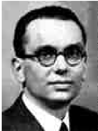
Kurt Gödel (1906-1978)